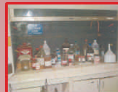
Use hoods for experiments, not storage.

In an Emergency Dial 2000 or 519-840-5000 or 911.