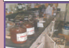
Keep lab benches free to avoid chemical spills.