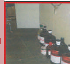
Do not store chemical on the floor.