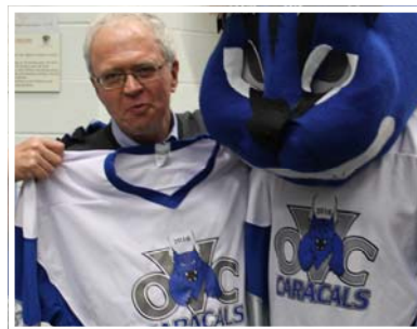
April was a busy month for retirement celebrations...