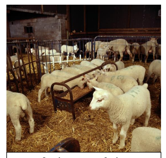
Lambs at a creep feeder

During the first weeks of life, lamb growth and development is dependent upon the ewe's milk production. Lambs not receiving adequate milk during the first month of life are more prone to contracting infectious diseases and will show a poor overall growth performance. Although they will start nibbling on feeds within a few days of birth, lambs less than four weeks of age are non-ruminants; and will consume high levels of milk and very little in terms of dry matter. Although feed intake is minimal during these first weeks, it is important to introduce creep feed to the lambs at roughly 10 days of age. If using a commercial creep feed, it is best to begin with an 18% crude protein ration. Having lambs adapted to eating creep feed will greatly lessen the stress of weaning. Always offer the creep free choice to the lambs, but devise a means of preventing ewes access to the ration (creep feeder). It is also advisable to provide lambs with good quality hay that is leafy and